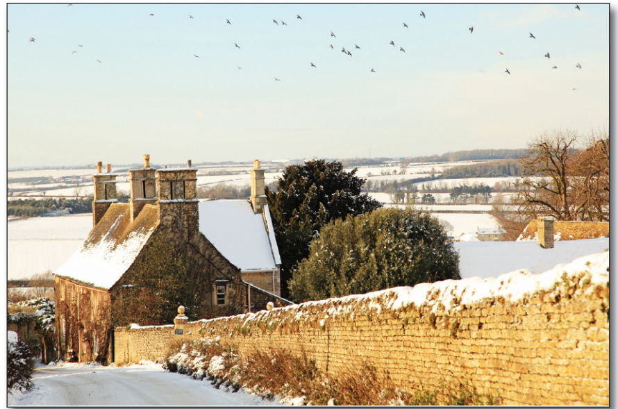
Steep Hill, Collyweston