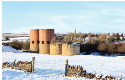
Drying Kilns near Barrowden. Once used in the steel making process called calcification, these drying kilns at Barrowden reminded me of the torrets of some ancient castles. They now lie silent save for the constant cawing of the crows that have built their nests amongst them.